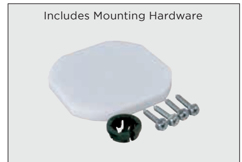
Includes Mounting Hardware