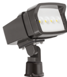
Slipfitter attachment DSXF1/2 TS