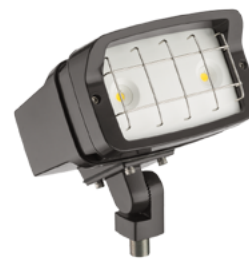
Wire Guard OFL1WG