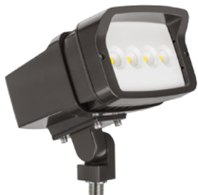
THK- Knuckle with 1/2" NPS threaded pipe