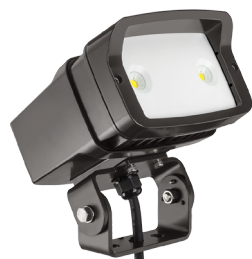
YK- Yoke mount