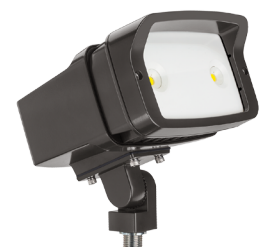
Vandal Guard (Polycarbonate lens) OFL1VG