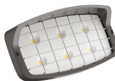
Wire Guard OFL2WG