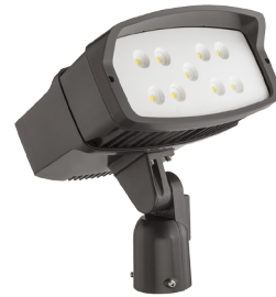
Vandal Guard (Polycarbonate lens) OFL2VG