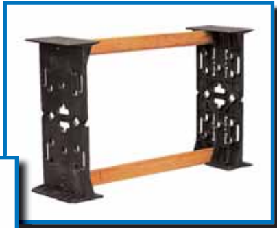
Work bench frame

ONE TOOL • Many uses • Many configurations