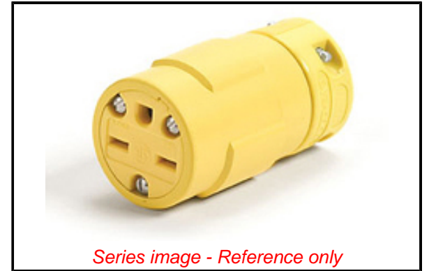
Series image - Reference only