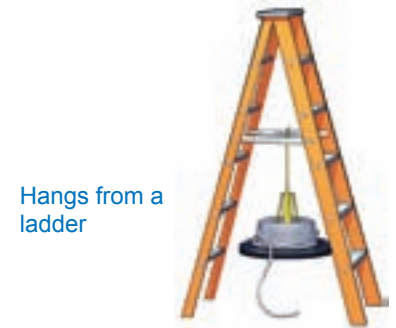
Hangs from a ladder