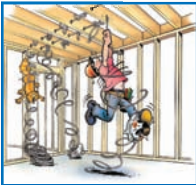
The Usual Way

This easy-to-hang wire dispenser allows fast, twist-free Romex, MC cable or Flex pulling.