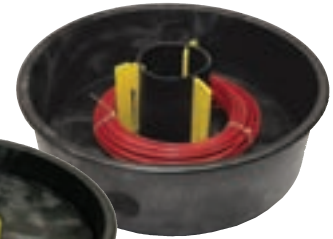
Salvaged wire ready for reinstallation