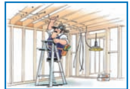
A New Way