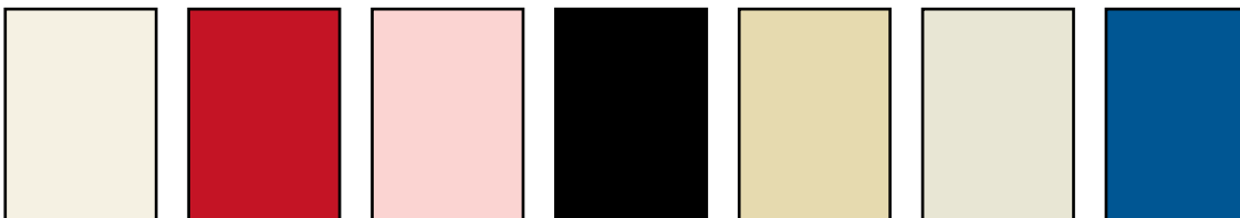
Primer Red Pink Flat Black Ivory Light Almond Blue

To order custom metal wall plates, see Pages P-40 – P-44.