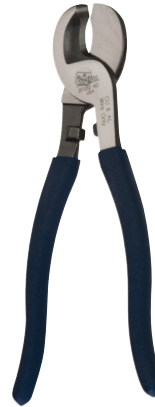
35-052 Cable Cutter w/ Dipped-Grip Handles