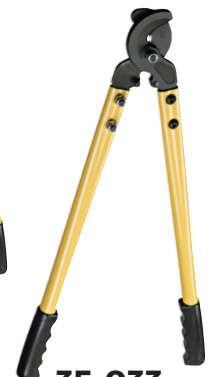
35-033 1000 MCM