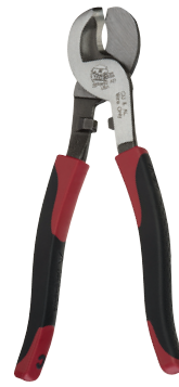
35-3052 Cable Cutter w/Smart-Grip™ Handles