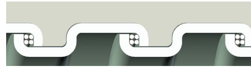
Square-Locked Design with cord packing 3/8" through 1-1/4"