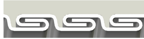
Interlocked Design 1-1/2" through 4"