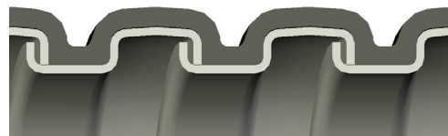
Square-Locked Design 3/8" through 2"