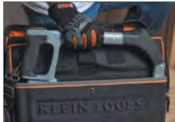
Top-loading hacksaw pocket with protective plastic lining.