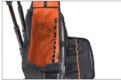
Wide open interior to accommodate large tools.