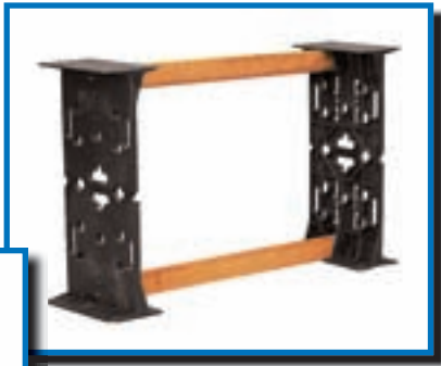
Work bench frame