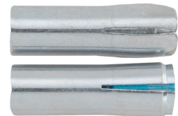
SMART DI+™ DROP-IN