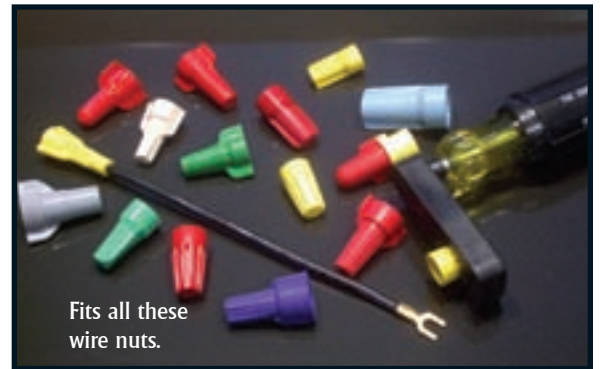
Fits all these wire nuts.

Do you prefer to twist your nuts or spin your nuts? Twisting is slow and can be painful, especially when carpal tunnel sets in. Why not spin your wire nuts with the NUT SPINNER? Much faster and easier, and it really cinches them up.