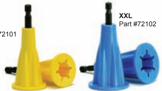
XXL Part #72102