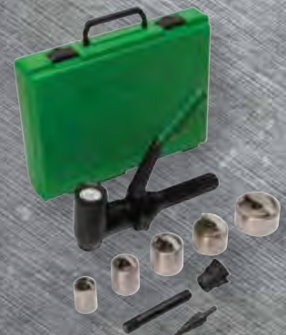
SPEED PUNCH™ KIT (w/Quick Draw 90 Driver)