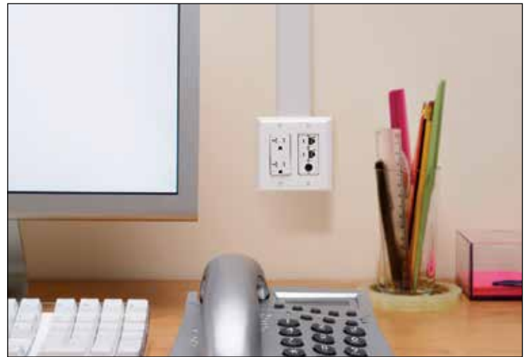
2300D Series Raceway in a typical office application.

400,800,2300 and 2300BACD Raceways are an ideal solution for use in classrooms, offices, hospitality applications, or anywhere a small, secure, low profile raceway is needed.