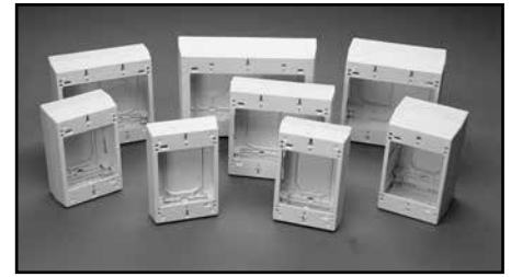
Sure-Snap Device Boxes are available in a variety of sizes and depths.