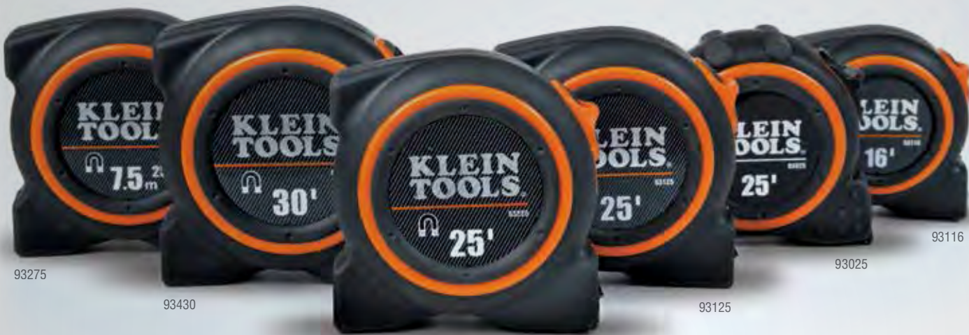
RARE EARTH MAGNETS