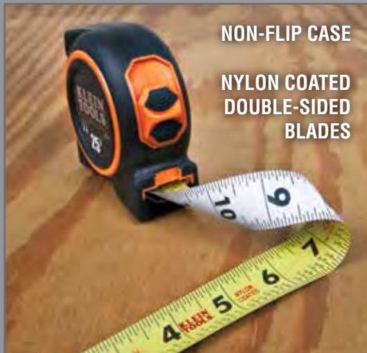
NON-FLIP CASE NYLON COATED DOUBLE-SIDED BLADES