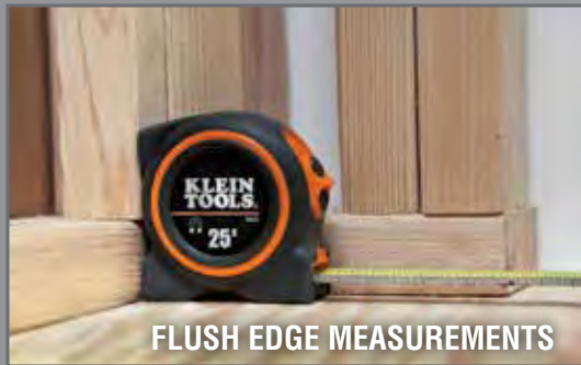
FLUSH EDGE MEASUREMENTS

For over 155 years, Klein Tools has set the standard that others measure up to! This new line of Tape Measures extends the Klein legacy of combining innovative features with Klein's quality, durability and comfort. With a Klein in your hand, you can be sure of quick, easy and accurate measurements, and a tape that will stand up to the measuring tasks at any job site.