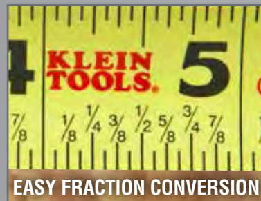
EASY FRACTION CONVERSION