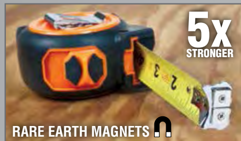
5x STRONGER RARE EARTH MAGNETS