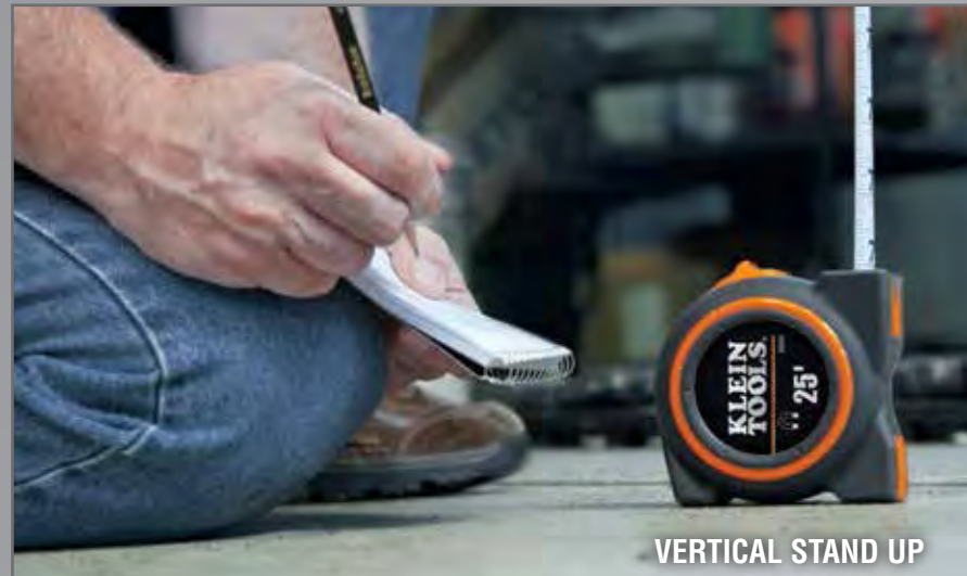
VERTICAL STAND UP