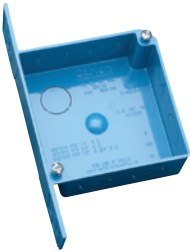
4" Square – 20 cu. in.