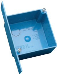
4" Square – 30.3 cu. in.