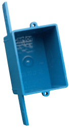
Single-gang – 16 cu. in.