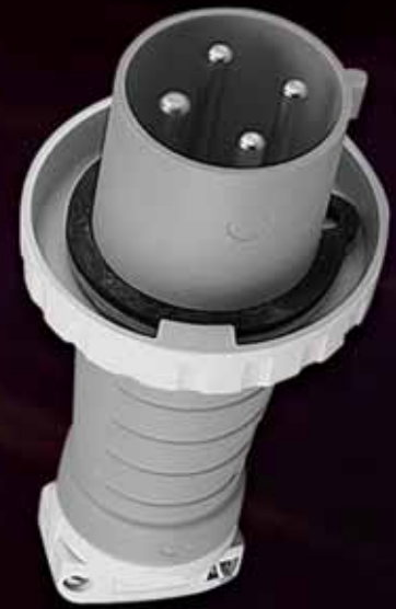
IEC 309 PIN AND SLEEVE