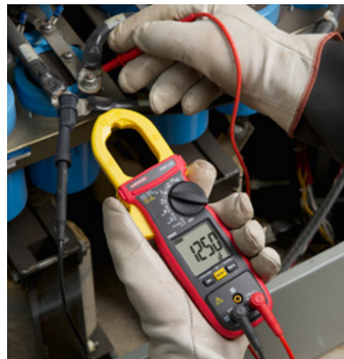
AMP-320 AC/DC Clamp Meter Electrical Motor Maintenance