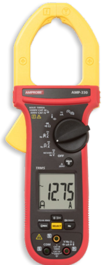
AMP-330 AC/DC 1000 A Clamp Meter Industrial Motor Maintenance