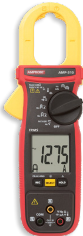
AMP-310 AC Clamp Meter HVAC