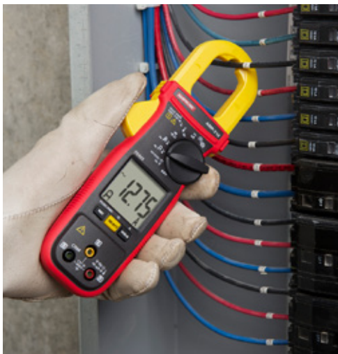
AMP-310 AC Clamp Meter HVAC