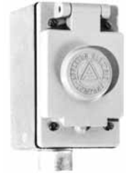
Single Cover on FS Box.