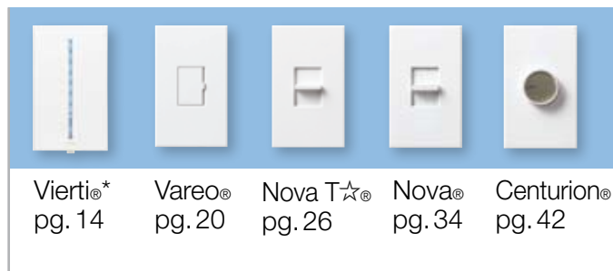
Vierti®* pg. 14 Vareo® pg. 20 Nova T☆® pg. 26 Nova® pg. 34 Centurion® pg. 42