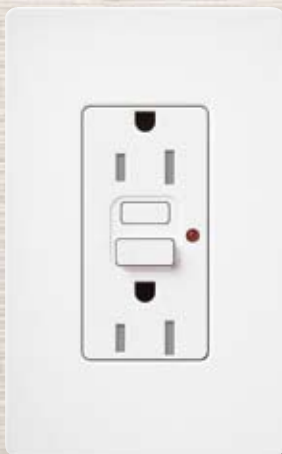
Tamper resistant GFCI receptacle