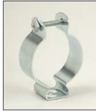
With Bolt And Nut