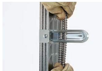
Insert Cables to be secured