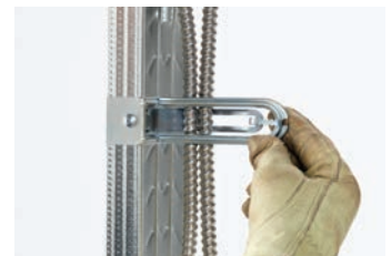
Once cables are inserted, wrap zip-tie around the end of the support to secure the cables