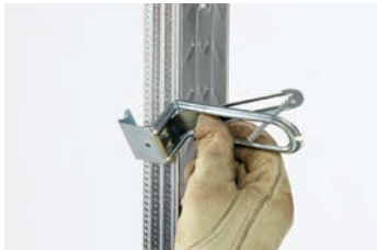
Push Support onto Stud