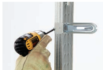
Support stays mounted to stud while securely attached with one screw