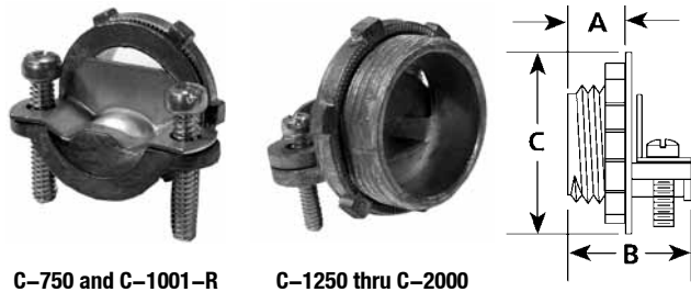
C-750 and C-1001-R