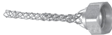
Wire Mesh Strain Relief for Cord Connectors