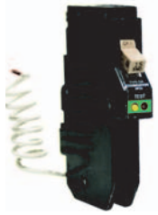
Type CH Single-Pole CAFCI Circuit Breaker