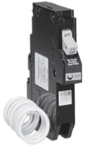
Type CH Single-Pole AFCI Circuit Breaker