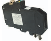
Type CH Single-Pole PON Combo AFCI Circuit Breaker