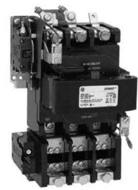
Typical CR306 Size 4 magnetic motor starter

Factory Installed Modifications: See pages 1-126