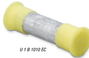
U 1 B 1010 EC