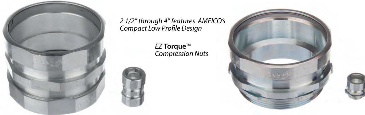
2 1/2" through 4" features AMFICO's Compact Low Profile Design

Available: Solid Alloy Steel Construction, Precision Machined EC Series: Compression Feature: AMFICO EZTorque Compression Nut Zinc Plated, Chromate Finish - Colors available Insulated Throat Bushing Option Available on Connectors*