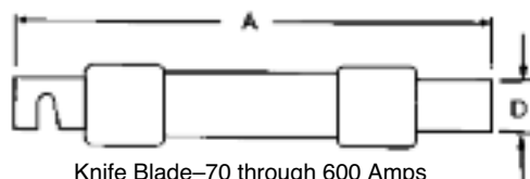
Knife Blade—70 through 600 Amps