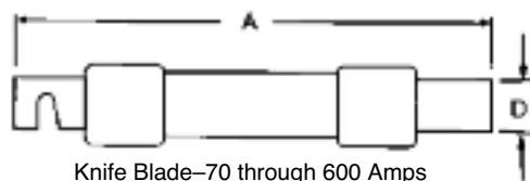
Knife Blade—70 through 600 Amps