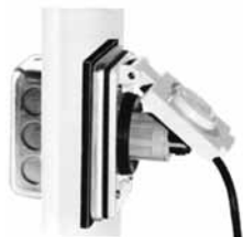
Receptacle Cover mounted on Switch Box with FSK-SBA Adapter/Gasket