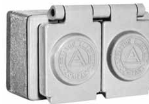
Duplex Cover on FS Box.

Typical application with NEMA configuration receptacle and plug, mounted on an FS box. Gasket seals around plug, keeping out moisture and dirt. Spring door closes automatically when plug is withdrawn to protect receptacle.