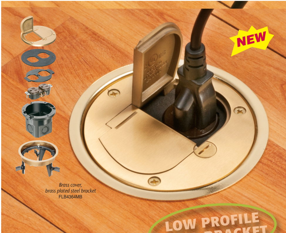
Brass cover, brass plated steel bracket FLB4364MB

Fastest, FLUSH installation • Low Profile Metal Covers, Steel Bracket