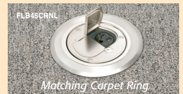
Matching Carpet Ring