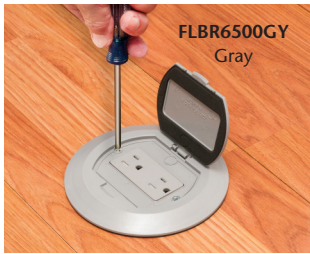
4 Fasten cover on box using the two #6-32 x 1" screws provided.