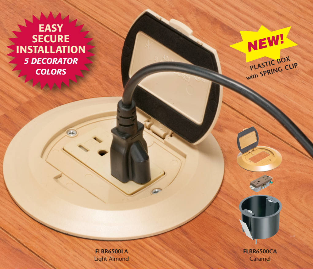
FLBR6500LA Light Almond