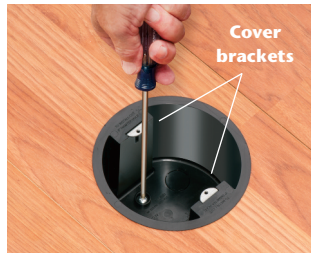
3 Rotate box to desired orientation. Tighten #10-32 screws to pull box securely against the underside of subfloor.