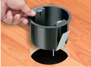
1 Cut a 5" diameter opening. Insert box.

Installs just like FLBR6500 series in a FLOOR