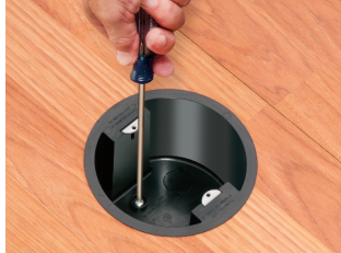
2 Secure box by tightening two #10 screws inside box.