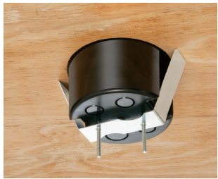
Underside of subfloor

3 Rotate box to desired orientation. Tighten #10-32 screws to pull box securely against the underside of subfloor.