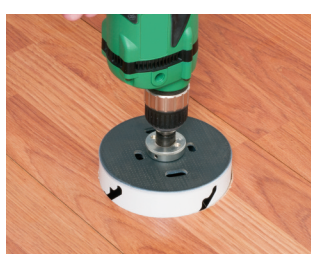
1 Using a hole saw cut a 5" diameter opening in the floor and subfloor.