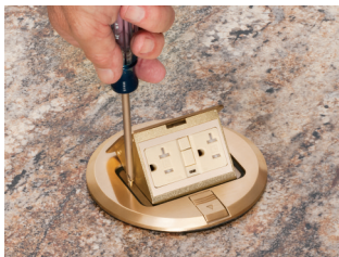
4 Install trapdoor coverplate to box using the two #6-32 screws provided. Round cover hides miscut openings