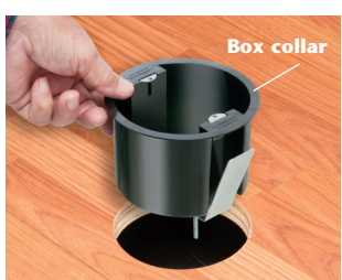
2 Pull wire through supplied NM cable connector. Insert box, bending the clip as necessary to fit through the opening.