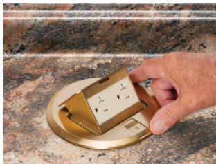
6 Rotate box/cover assembly into position, lining it up parallel with backsplash, if installing in a countertop.