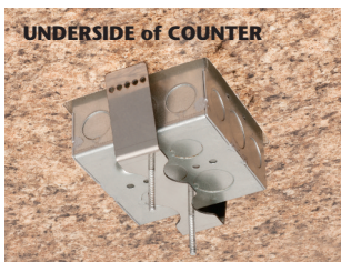
UNDERSIDE of COUNTER