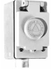
Single Cover on FS Box.