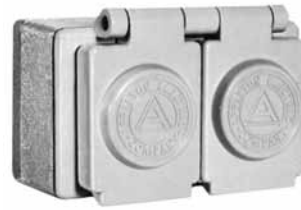
Duplex Cover on FS Box.

Typical application with NEMA configuration receptacle and plug, mounted on an FS box. Gasket seals around plug, keeping out moisture and dirt. Spring door closes automatically when plug is withdrawn to protect receptacle.