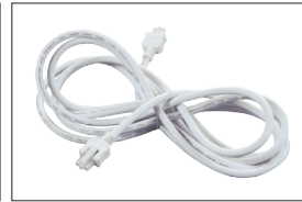
HU1011 18" Daisy Chain Connector