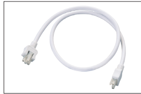
HU1010 12" Daisy Chain Connector