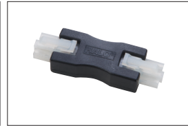
HU107 1-1/2" Male-to-Male Connector

Finish: P = White; MB = Matte Black Example: HU101P = 3" Daisy Chain Connector, White