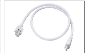
HU103 24" Daisy Chain Connector