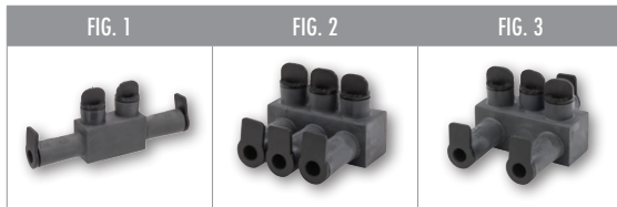
Figure varies by number of wire ports.