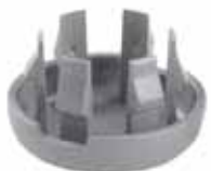
Part # KOK Series