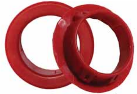
Part # SB220