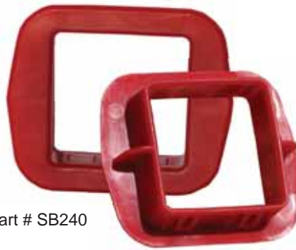
Part # SB240