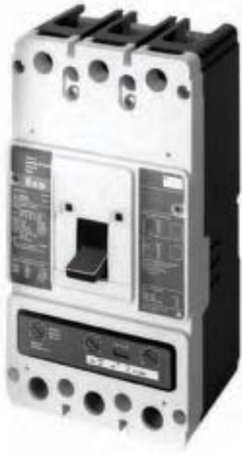
Typical K-Frame Circuit Breaker