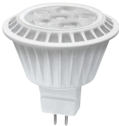
7W 12V MR16