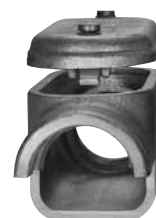
Appleton FM7 (C57, 1-1/2") 28 Cubic Inches Capacity Flat-Back Design

Illustrated views are cut away to demonstrate back configurations.