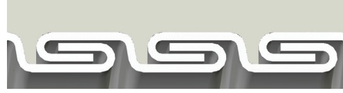
Interlocked Design 1-1/2" through 4" with no bonding wire