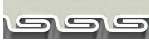
Interlocked Design 1-1/2" through 4" with no bonding wire