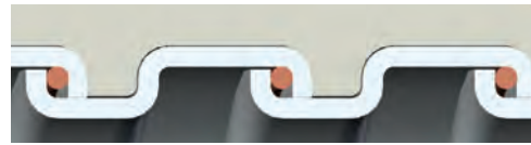
Square-Locked Design with integral bonding wire 3/8" through 1-1/4"