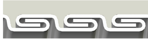
Interlocked Design 1-1/2" through 4" with no bonding wire